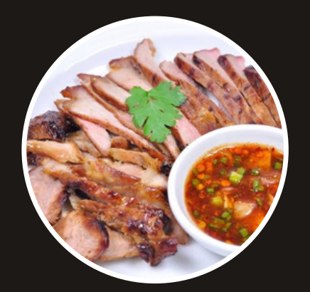
Grilled Pork Grilled pork shoulder steak