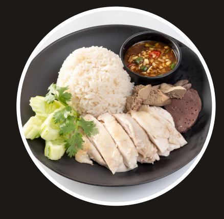
Khao mun kai