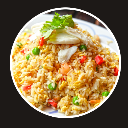
Thai basil fried rice