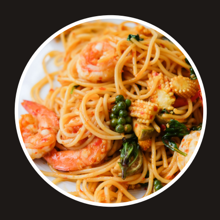
Pad kee mao