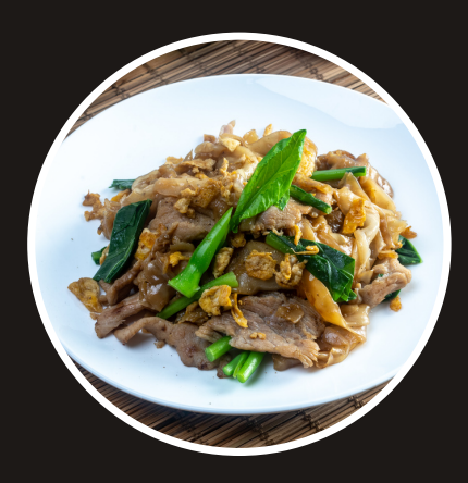
Pad see ew