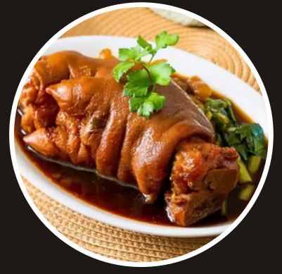
Pork Leg Stew (Khao kha moo)